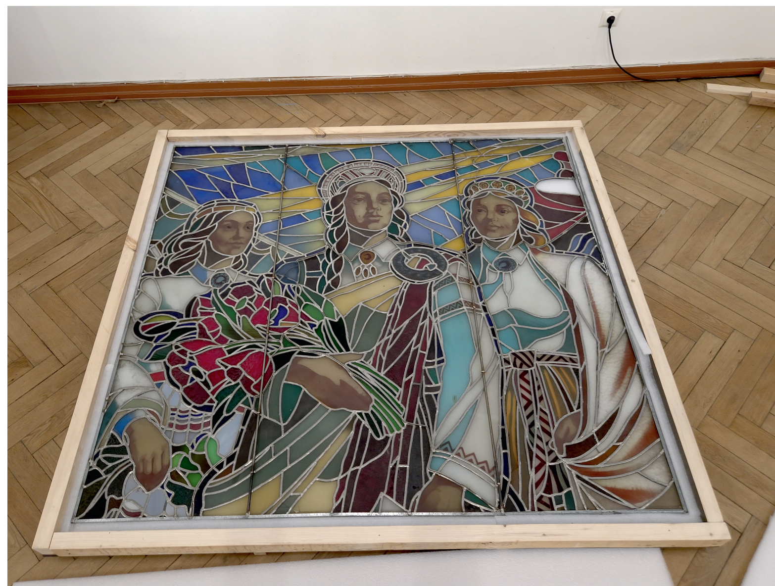
2., 3., 4. Packaging process of a fragment from Egons Cēsnieks' stained glass "Song Festival of Soviet Latvia" using a wooden frame and MDF construction