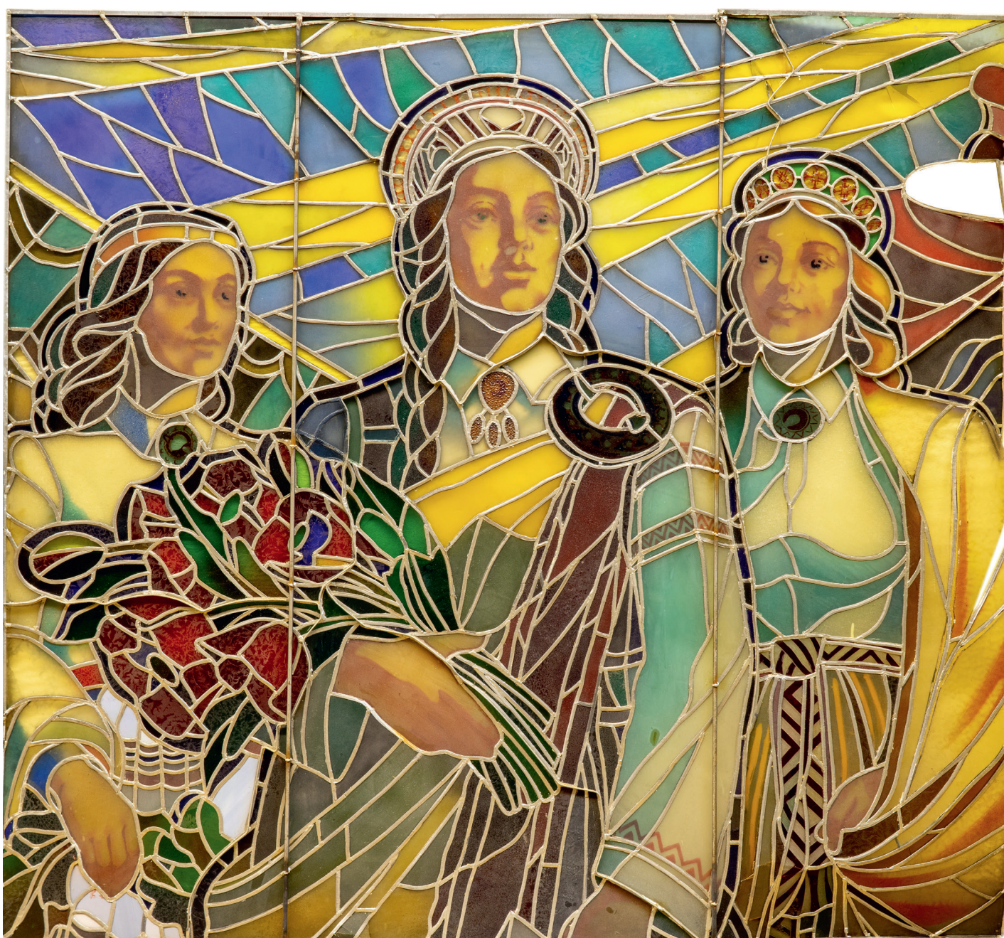
1. Fragment of Egons Cēsnieks' stained glass "Song Festival of Soviet Latvia"