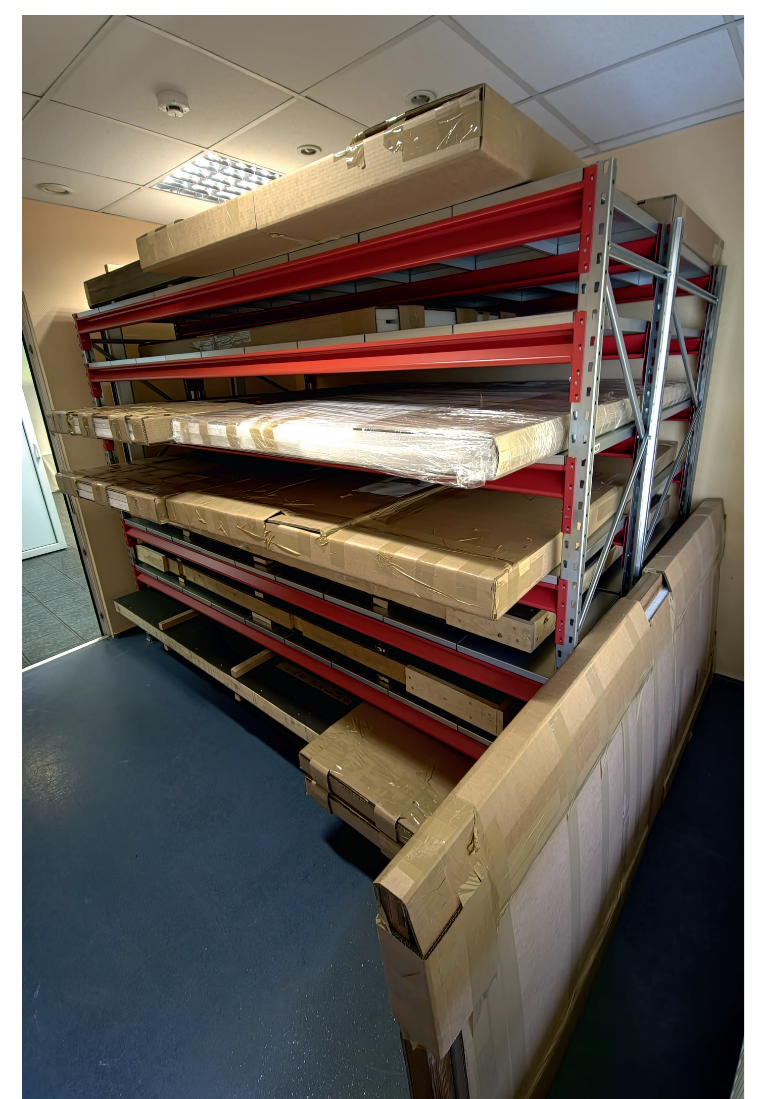
10. Packed stained glass collection in the shelves in the new temporary storage facility