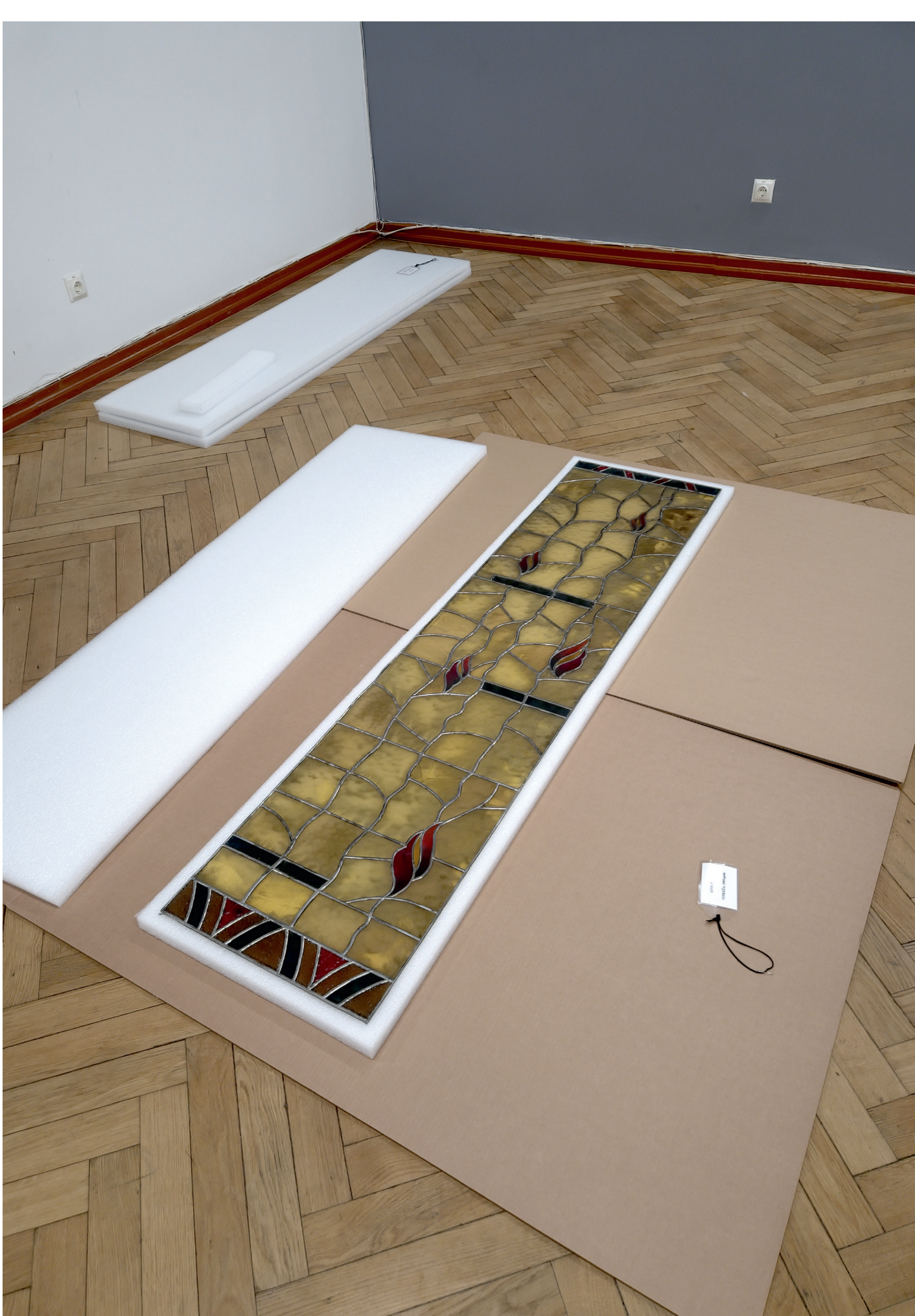
7., 8. Packaging process of a stained glass using a corrugated cardboard construction