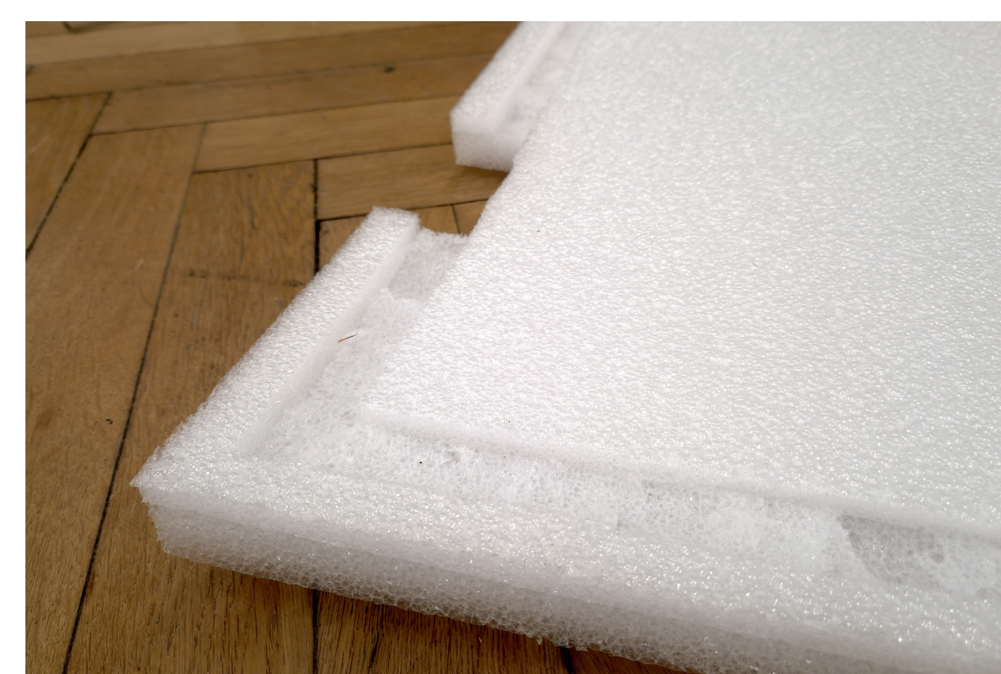
6. Grooves cut into the Plastazote sheet