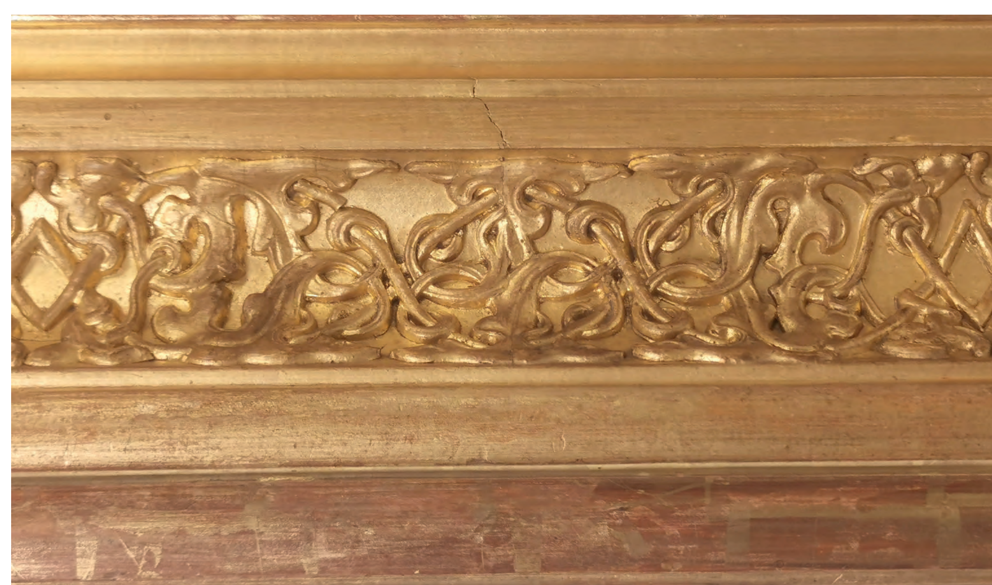
Same after aging/toning