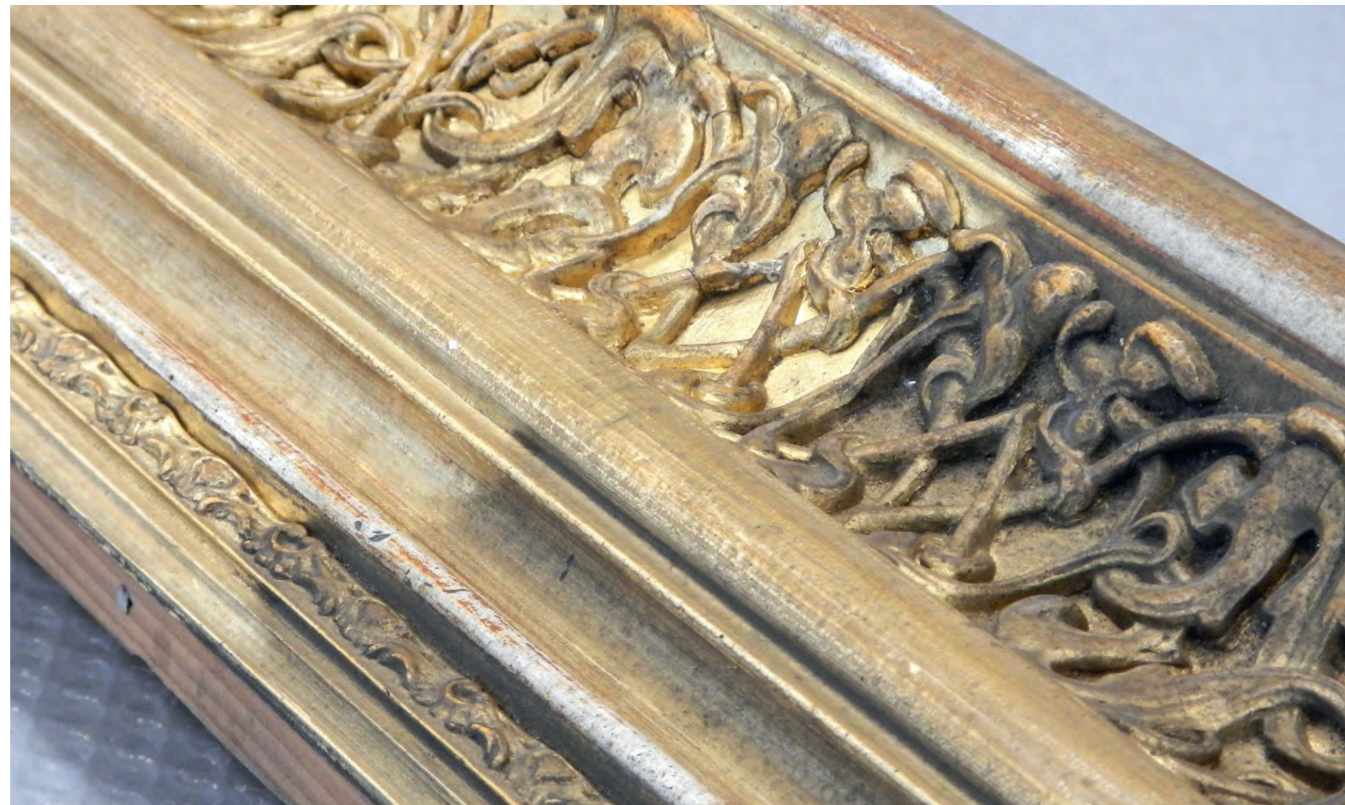
Cleaning in process

Agreed with painting restorer and collection curator – preserve historical patina and maintain visual harmony with the painting.