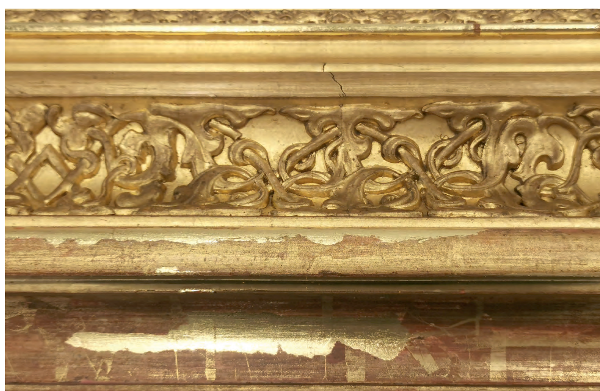
Gold leaf patches