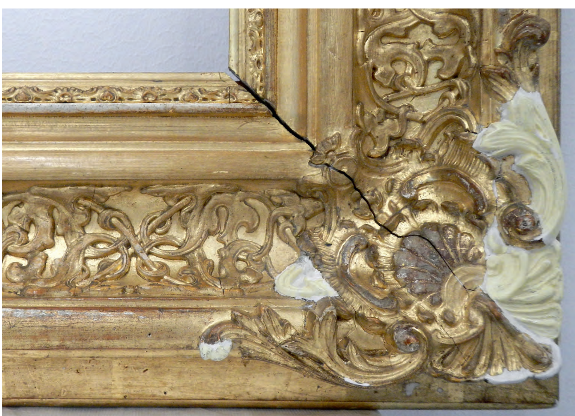
Same with reconstructed fragments