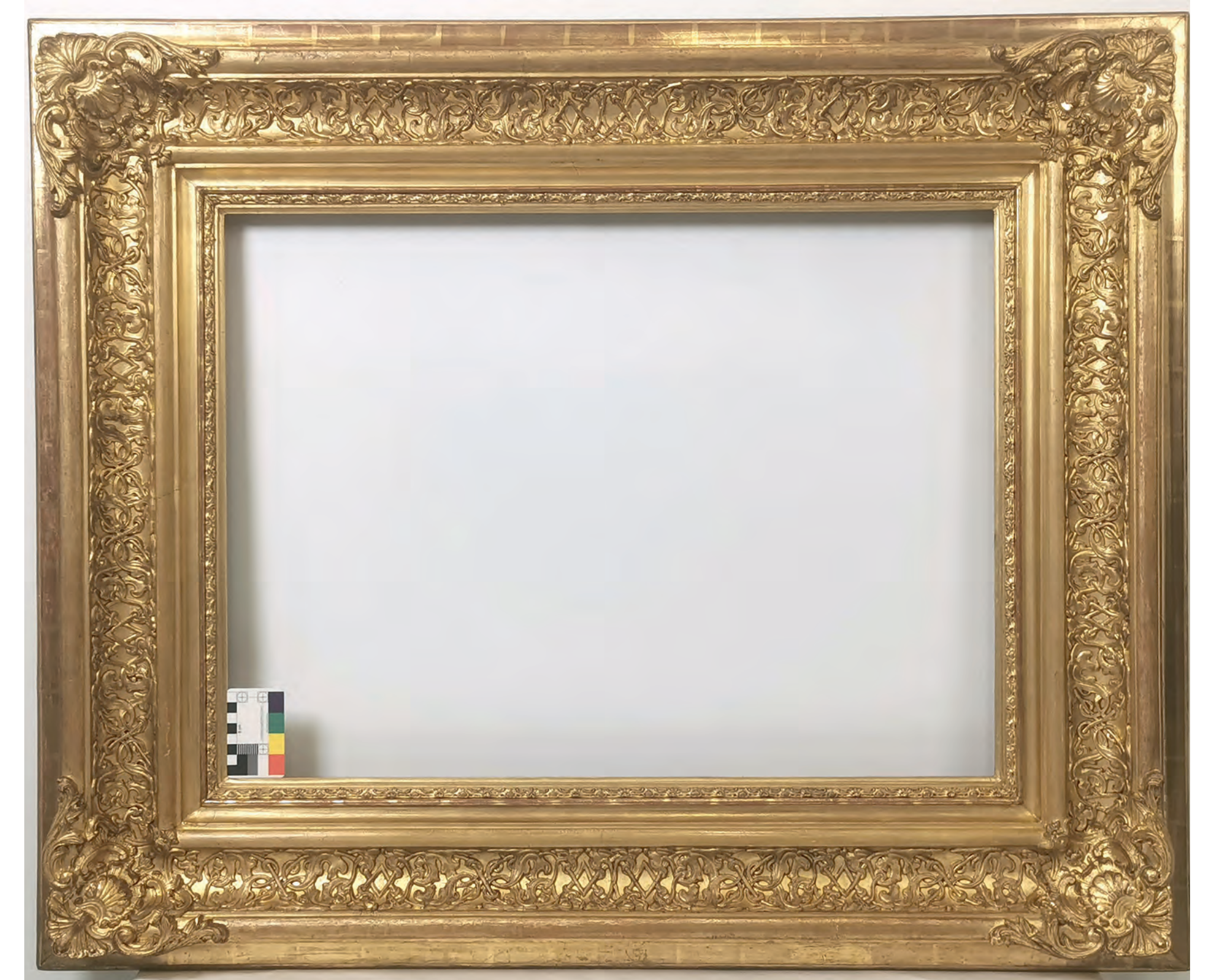
Upper frame AFTER