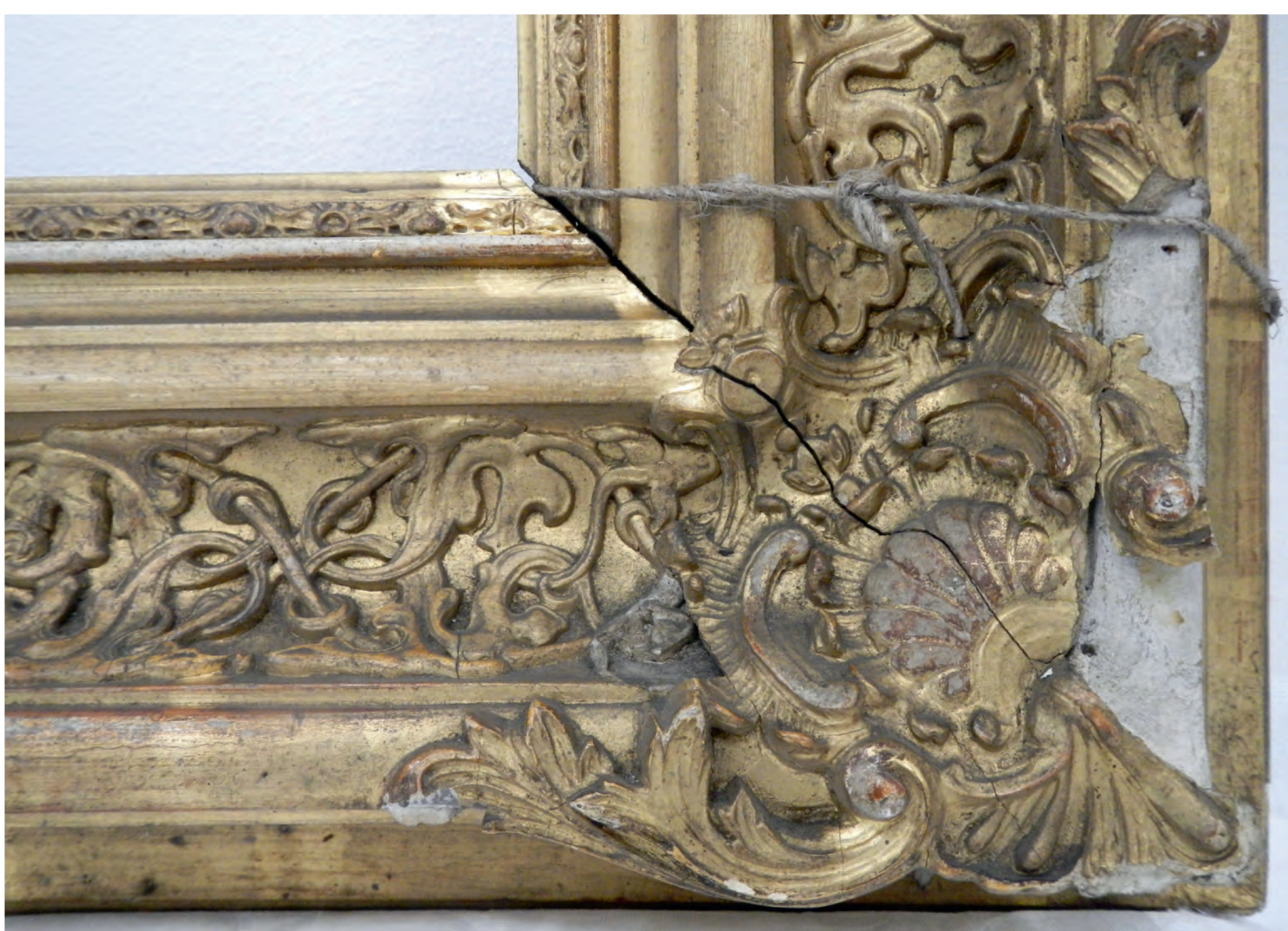
Most damaged corner BEFORE