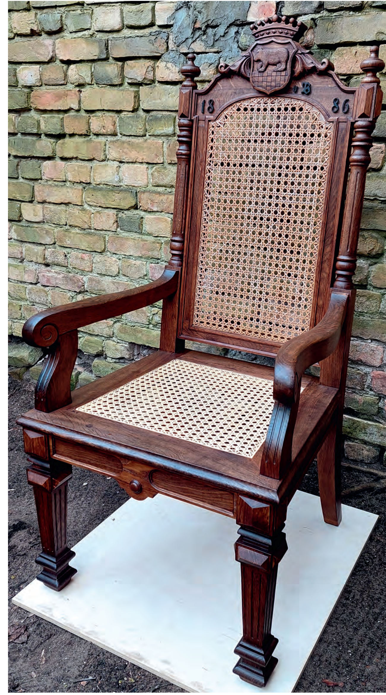
Chair after restoration