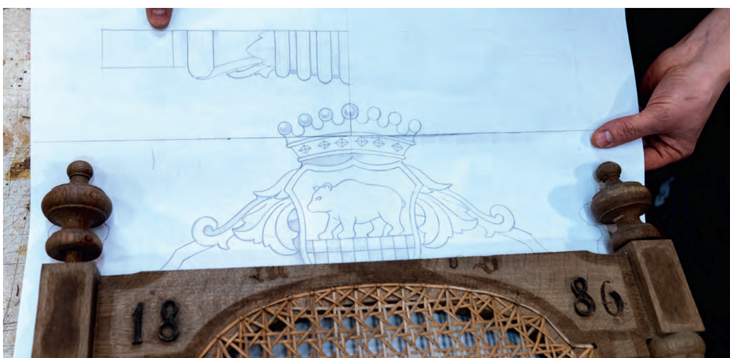
Reconstruction of missing heraldry