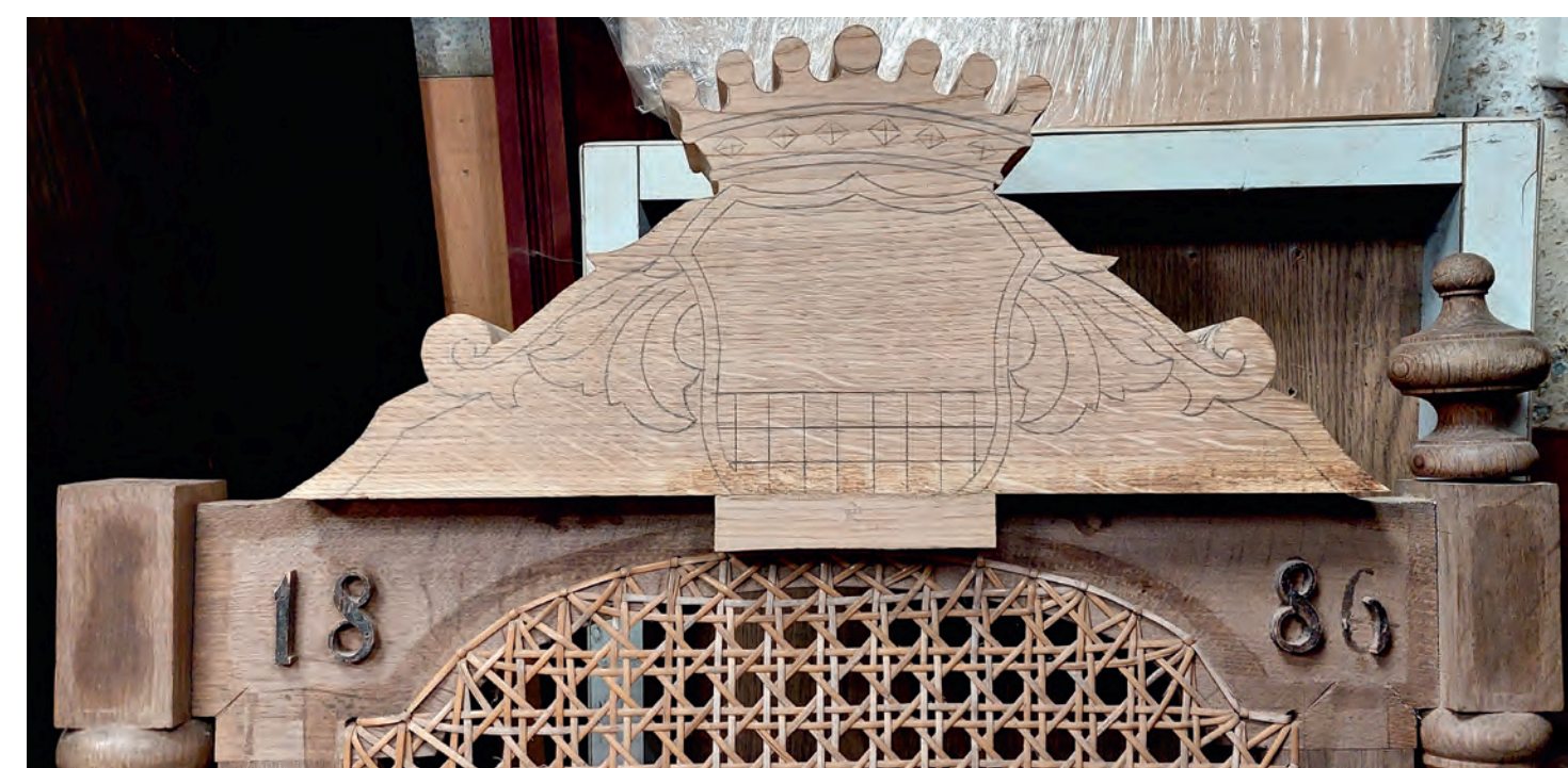
Reconstruction of missing heraldry