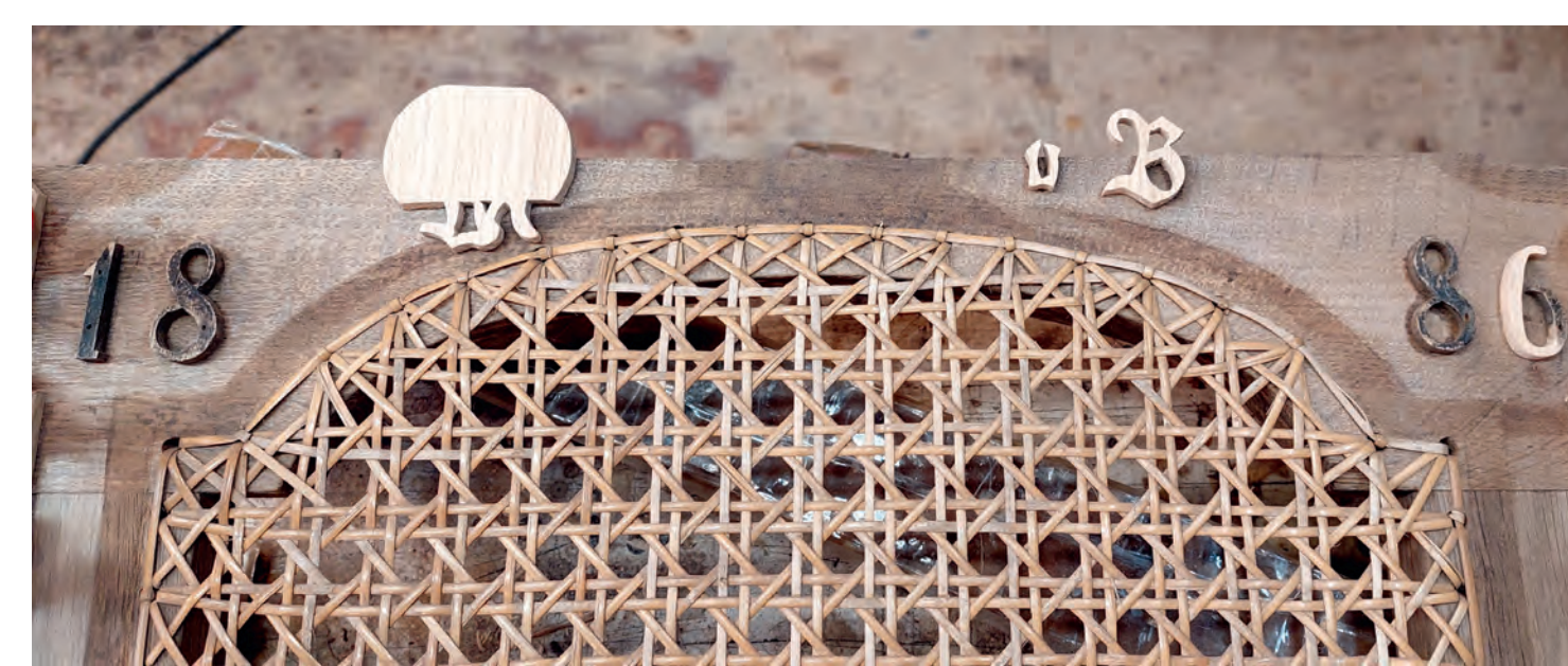
Reconstruction of missing letters from wood