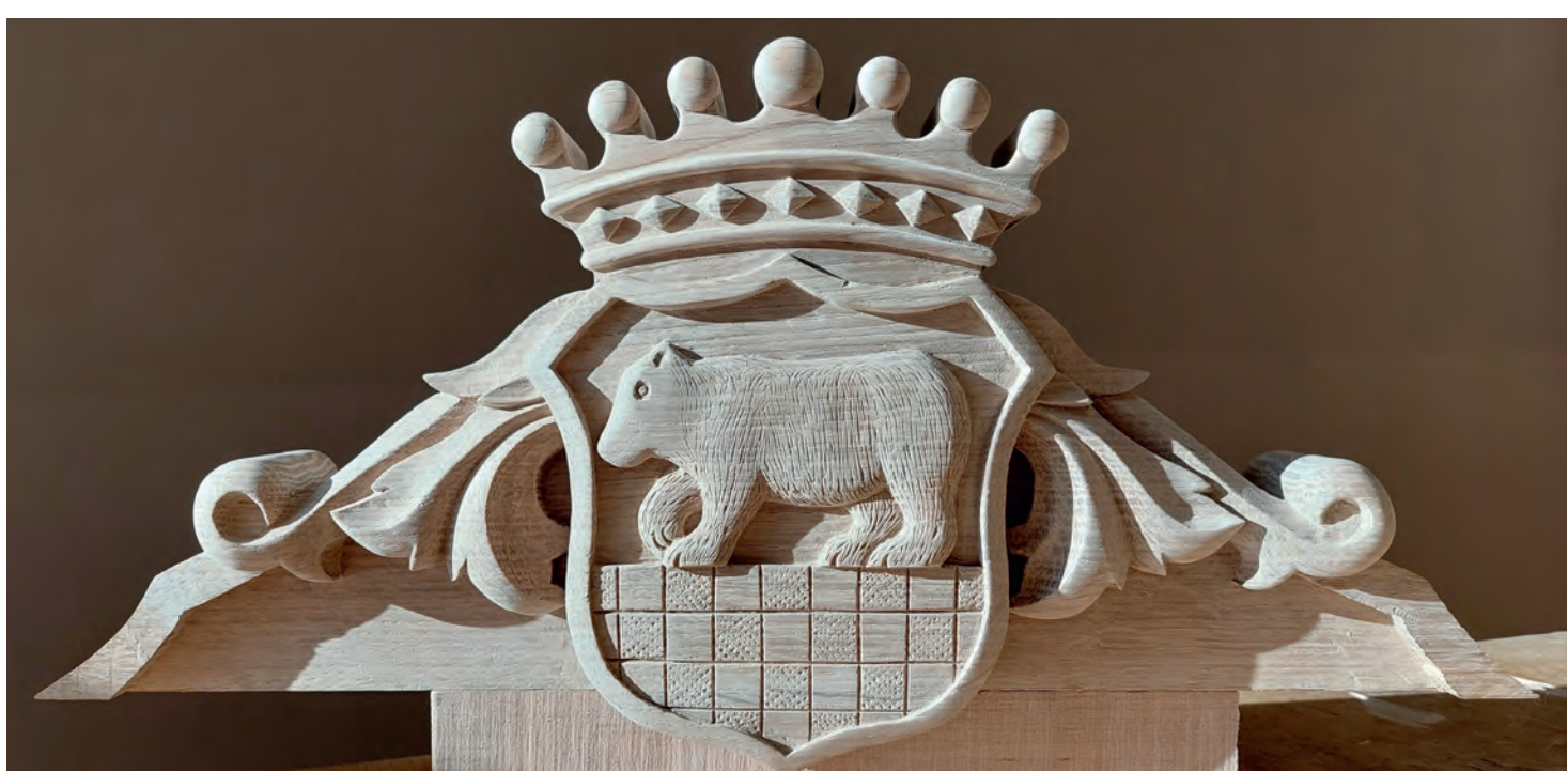
Reconstruction of missing heraldry