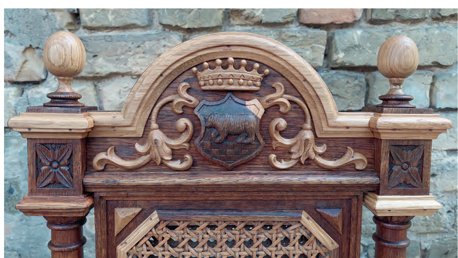
The model from which the woodcut of the heraldic bear was made