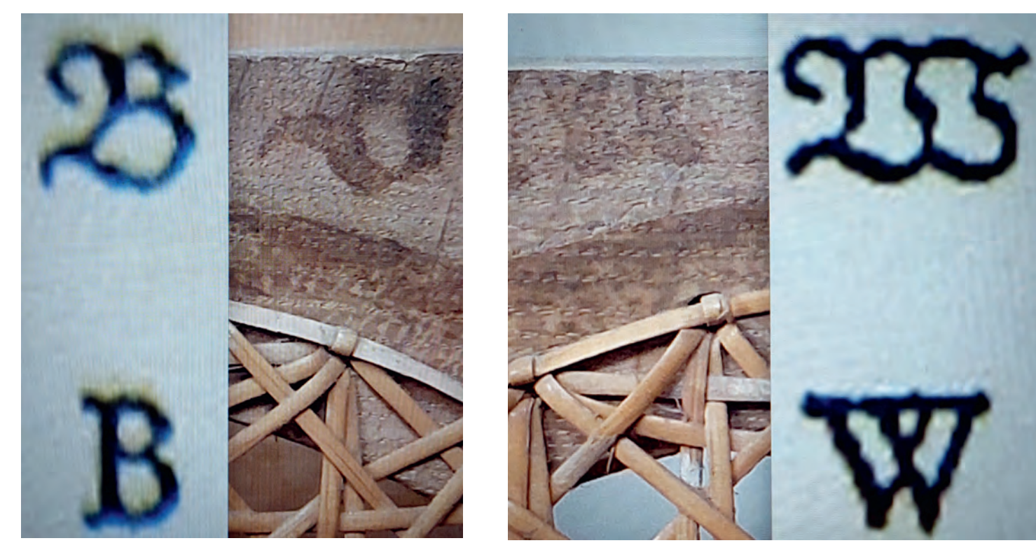
Reconstruction of missing letters