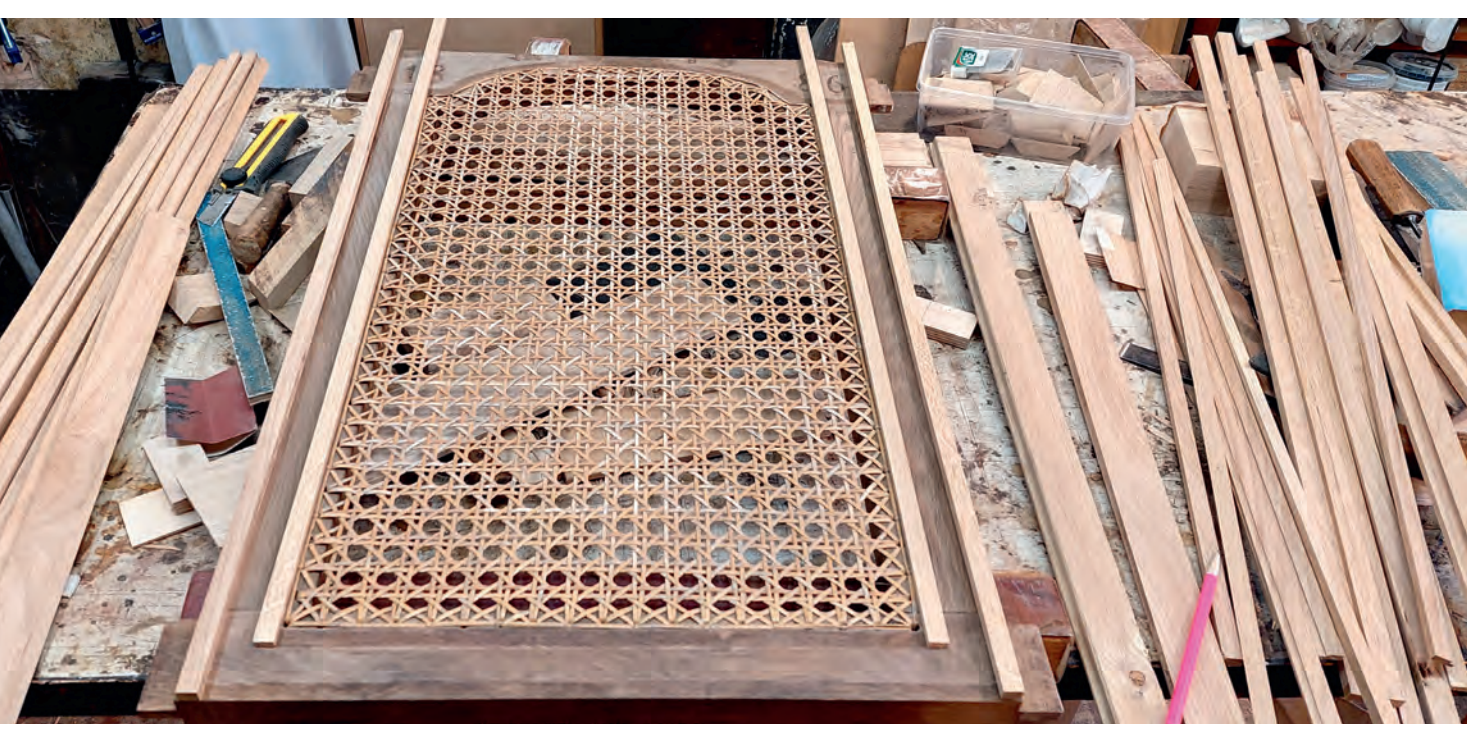
Making new oak profile slats