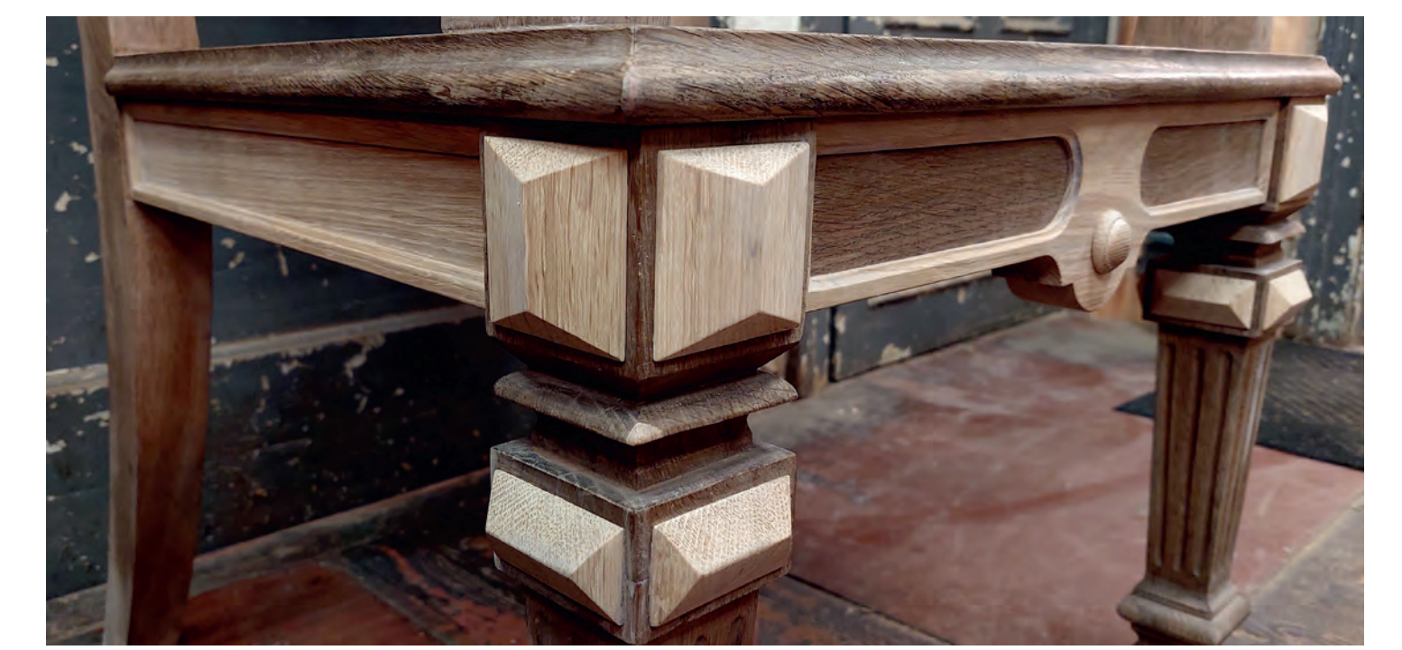
New profile parts have been incorporated