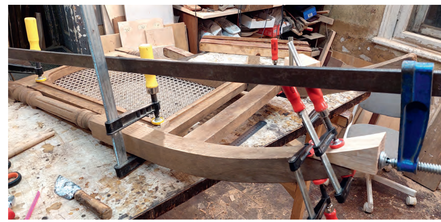
The process of gluing the structure of the chair