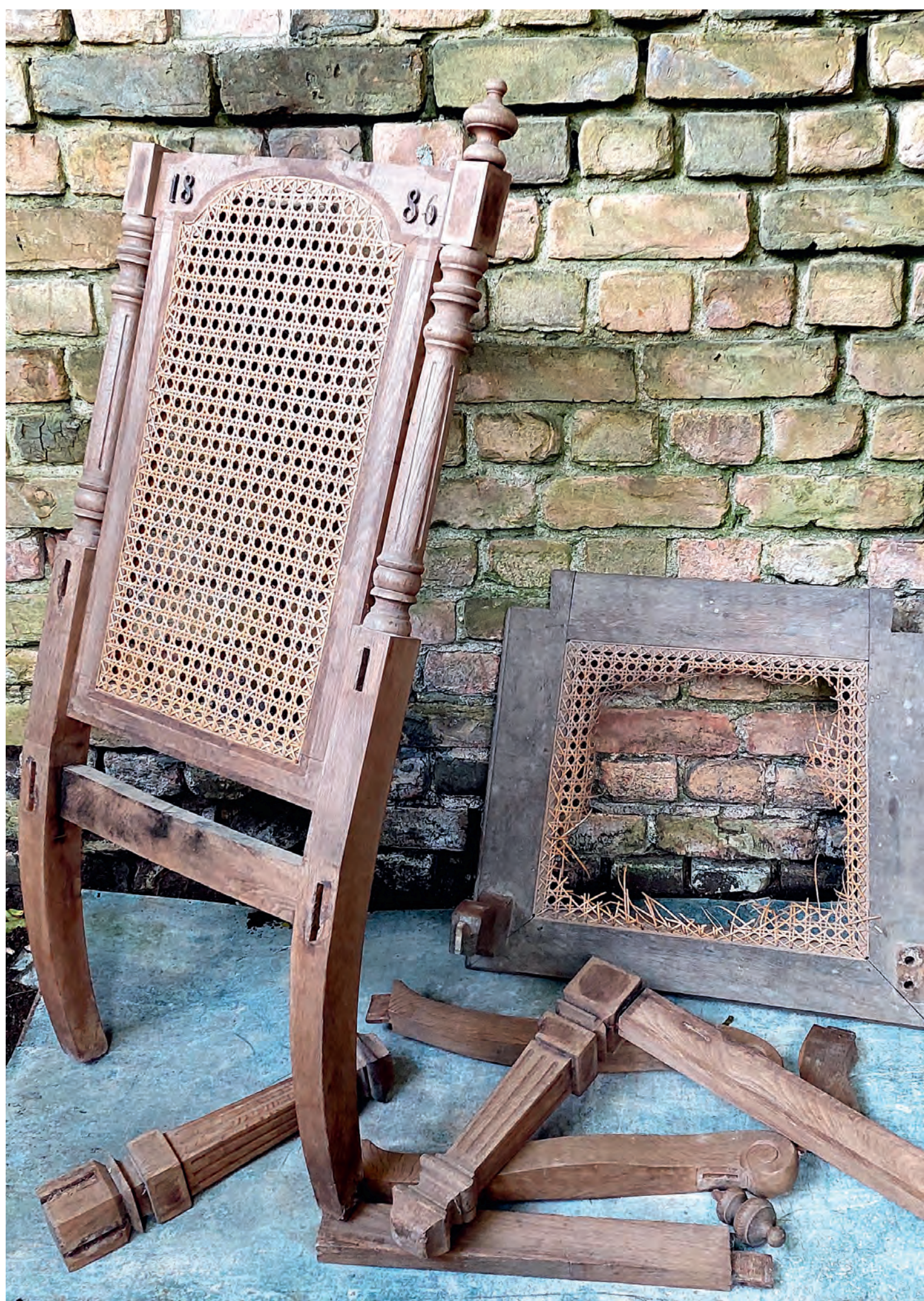
Chair before the restoration