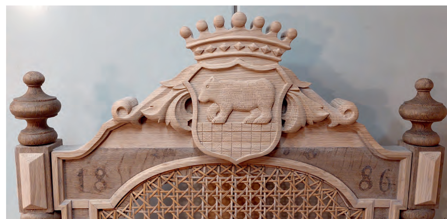
New oak heraldry have been incorporated