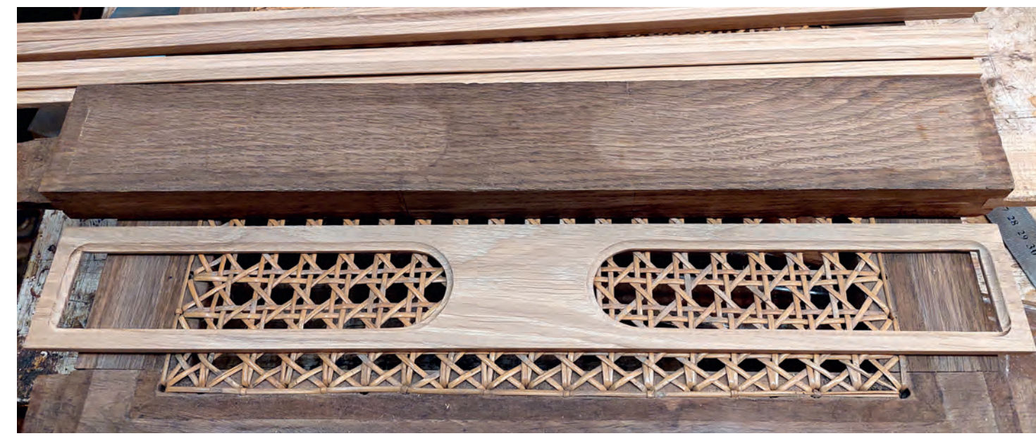
Making new oak parts