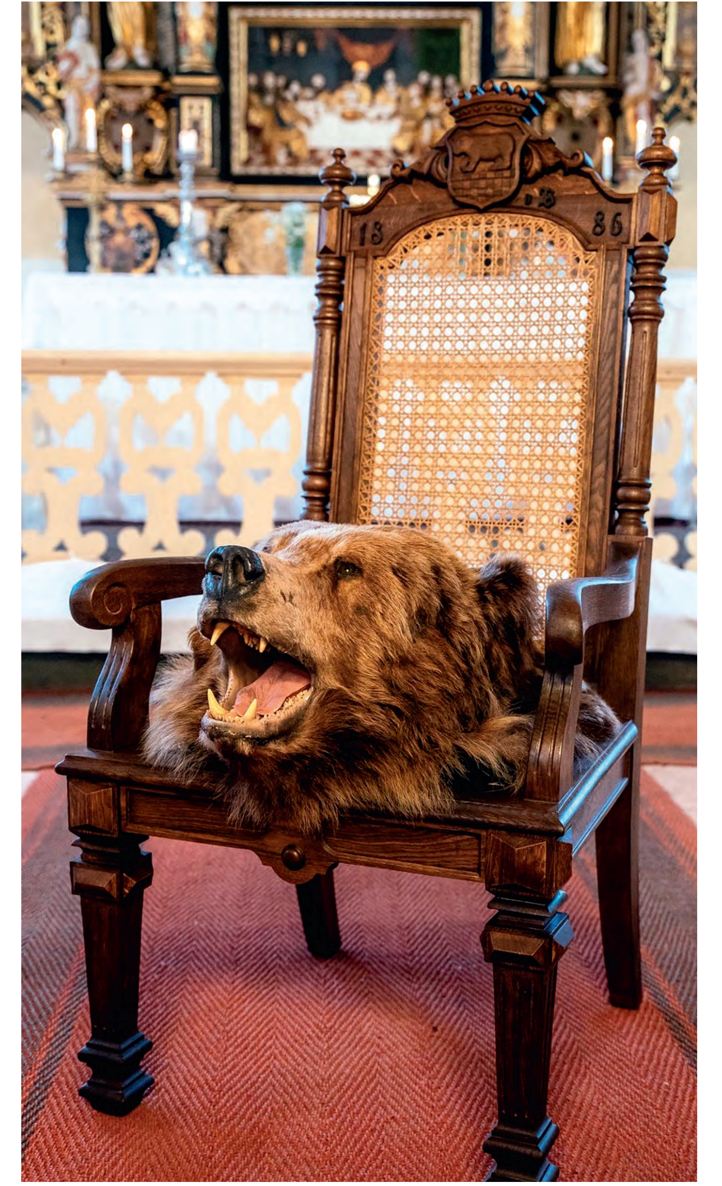
Chair after restoration at Zlēkas Evangelical Lutheran Church